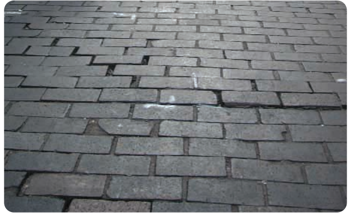
above right Lisle Street is often congested and difficult for pedestrians to negotiate