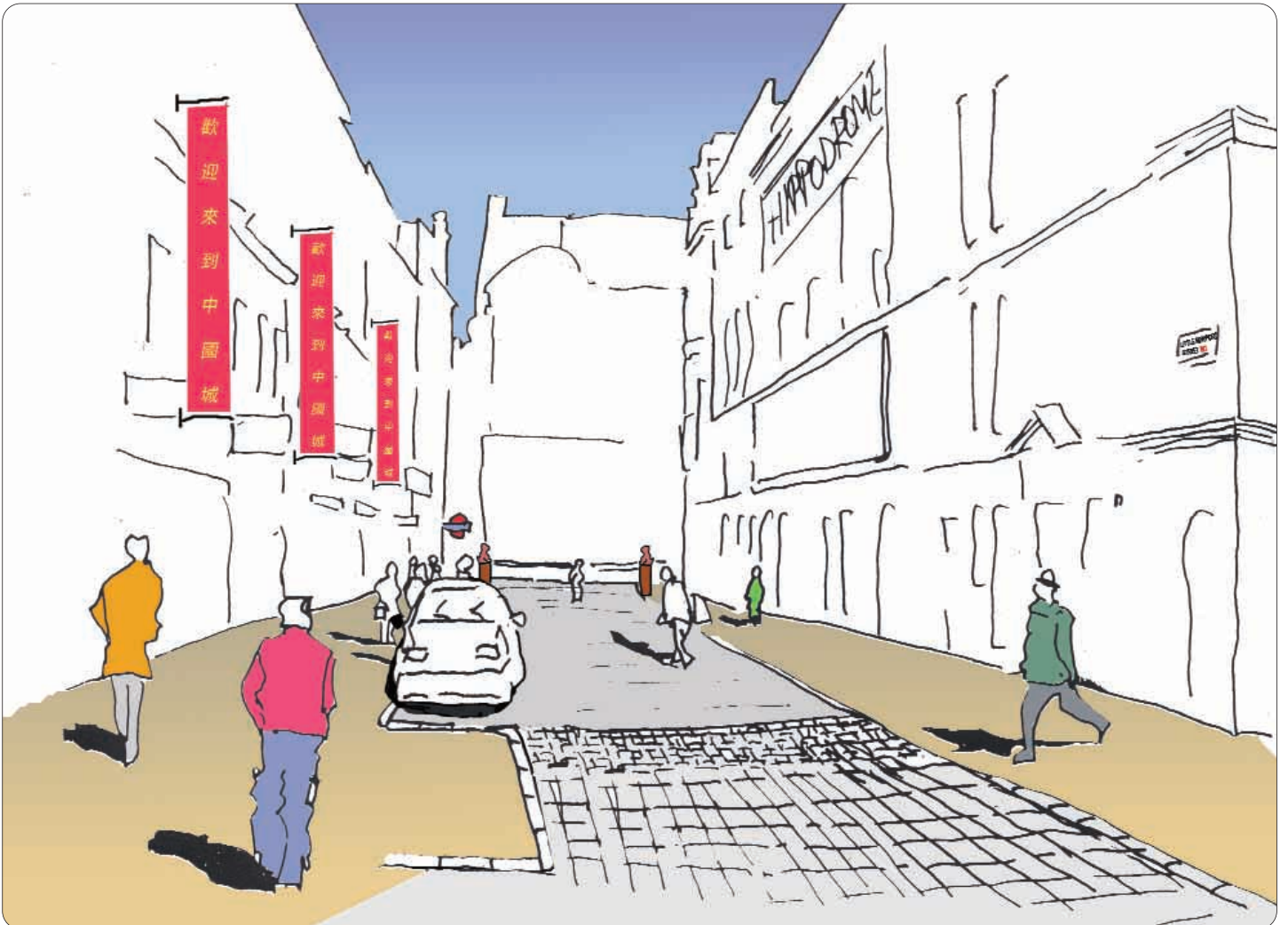
below Artist's impression after improvements