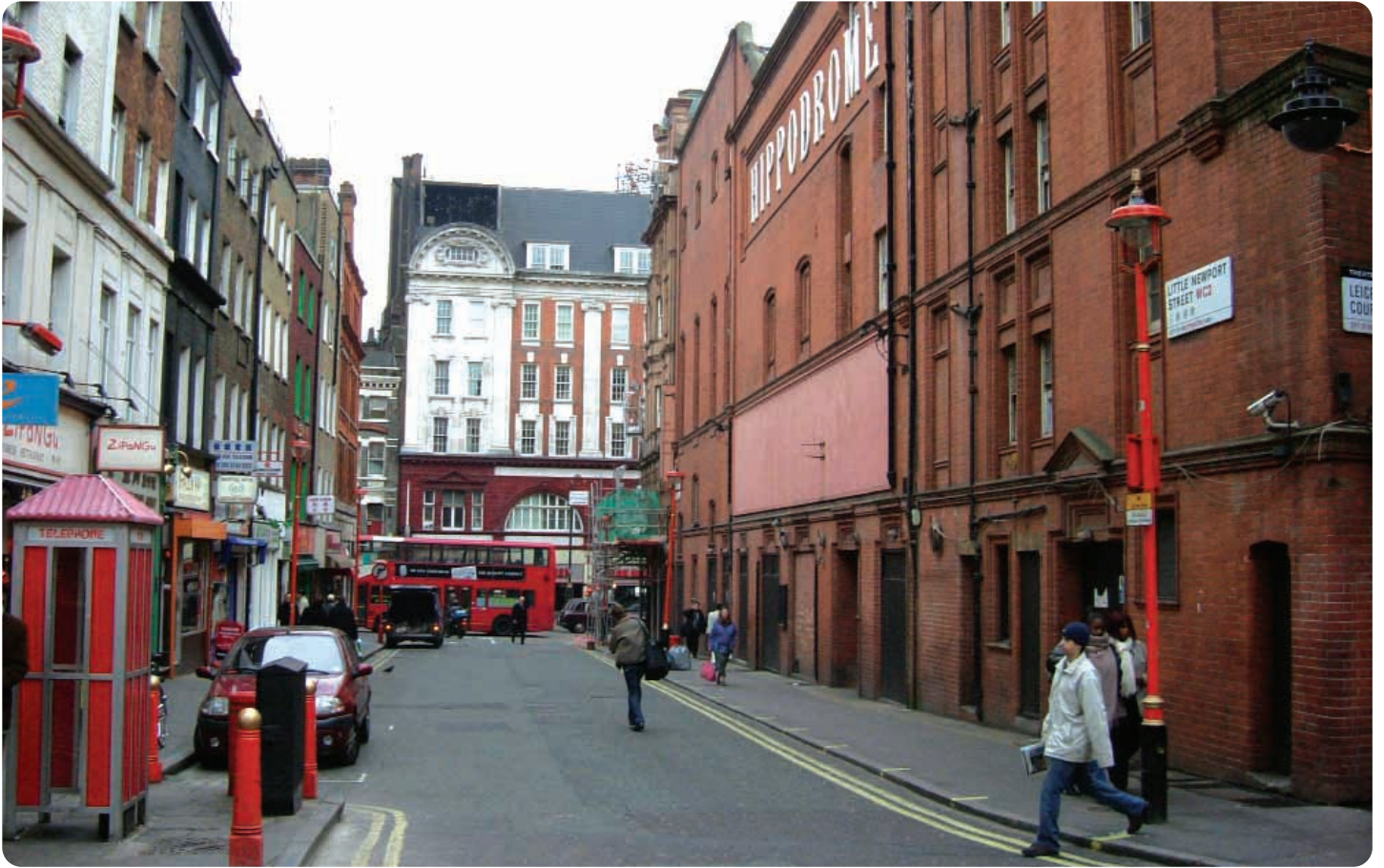
above Existing view of current junction at Little Newport Street and Leicester Court