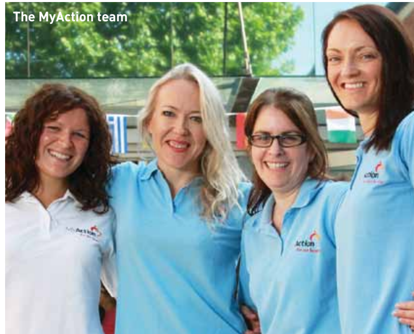
The MyAction team

It is a 16-week preventative programme run by health professionals for people at risk of developing a vascular disease involving exercise classes, stress management, nutritional assessment, healthy lifestyle advice – all tailored to individual needs.