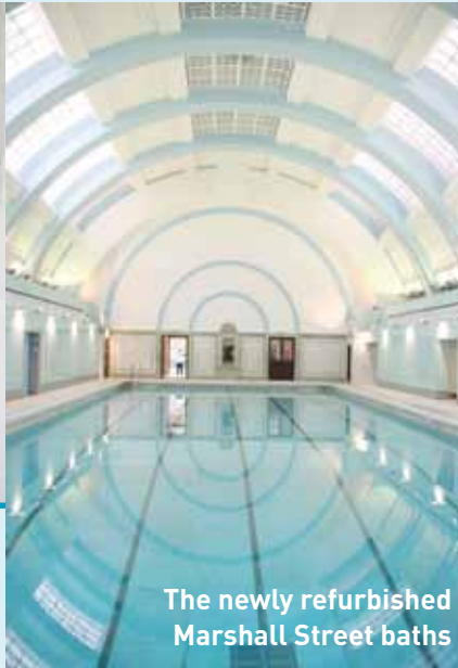
The newly refurbished Marshall Street baths